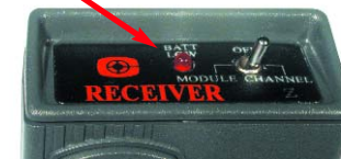
Battery low indicator