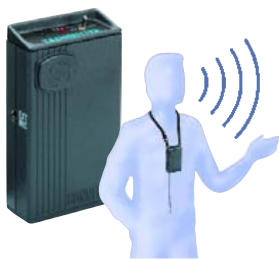
The speaker wears the radio microphone transmitter to pick up their voice

This loan equipment will enable you to hear more clearly and help you to enjoy your visit.