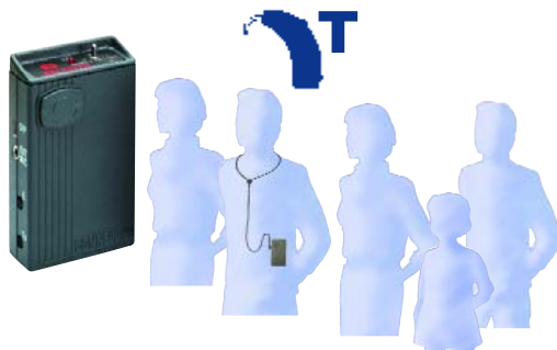
You wear the radio receiver to feed the sound directly to your hearing aid via the neck loop