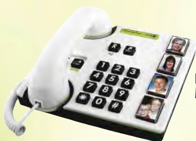
Doro MemoryPlus 319