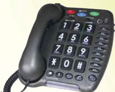
Geemarc AmpliPOWER 50