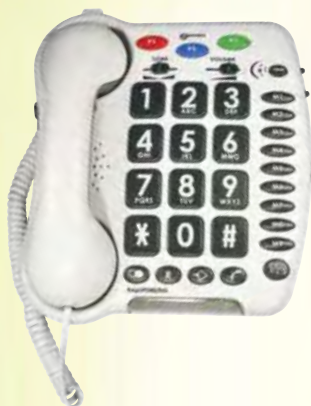
Geemarc AmpliPOWER 40