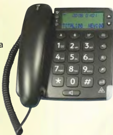
Doro Magna 4000